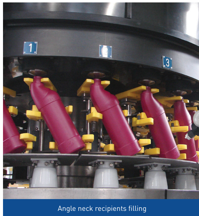
Angle neck recipients filling

or straight necks, complex caps...) and formulas (concentrated, scented...), Serac positions itself as a reliable partner for developing machines with a long-term business overview.